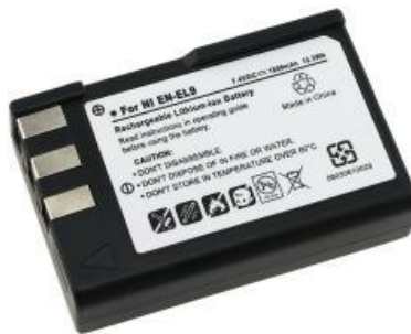
INSTEN Li-Ion Battery for Nikon EN-EL9/ D40/ D40X/ D60 (Pack of 2) - $11.99