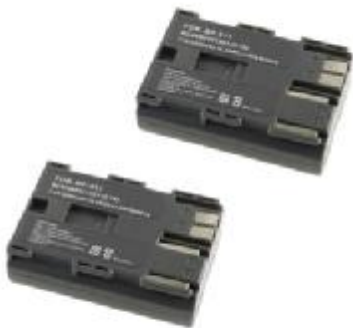
INSTEN Battery for Canon BP-511 (Pack of 2) - $10.99