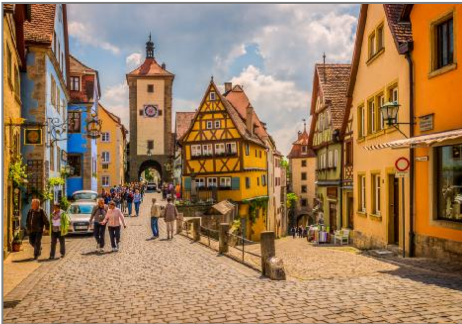
After, see Page 4 for the complete story.

Meetings will be held the first and third Tuesday, 7:30 PM, at Touchmark 2911 SE Village Loop, Vancouver WA. Cntrl Click Touchmark Web Site