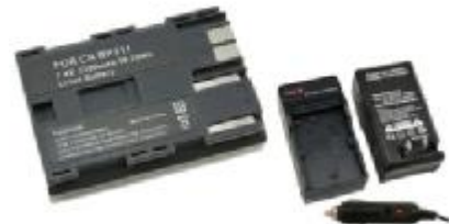
INSTEN Camera Battery and Charger for Canon Rebel EOS/ 20D/ 30D/ 40D/ D60/ G5—$9.99