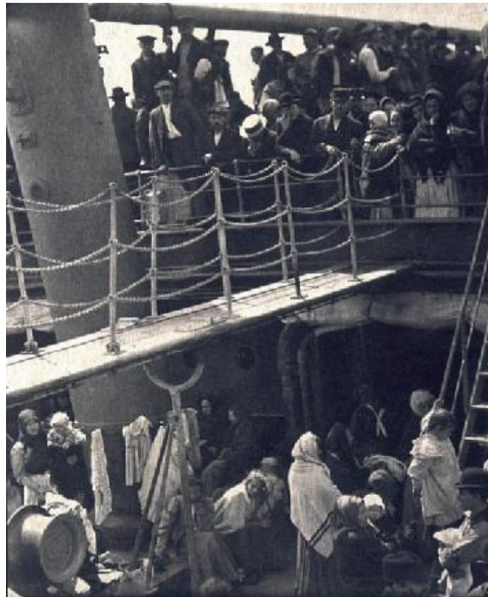
Alfred Stieglitz The Steerage

Alfred Stieglitz, "Simplicity in Composition." From: The modern Way of picture making , 1905